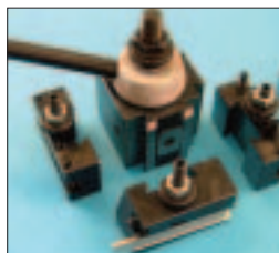
Quick change tool post Item No. 8017

Additional standard holder Item No. 8017A